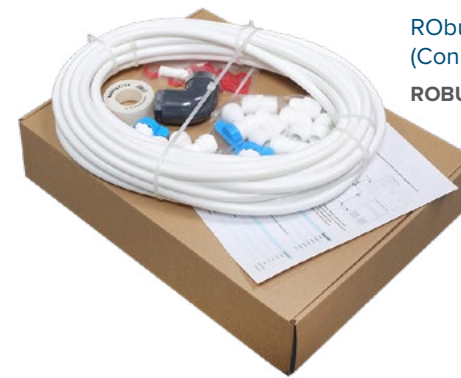
RObust Connection Fitting Pack (Connect up to 3 appliances) ROBUSTKIT