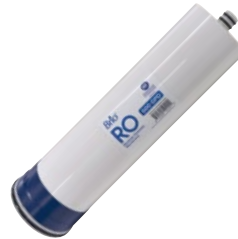
Brio 3012-600 RO Membrane - 600 GPD RFROM3012600