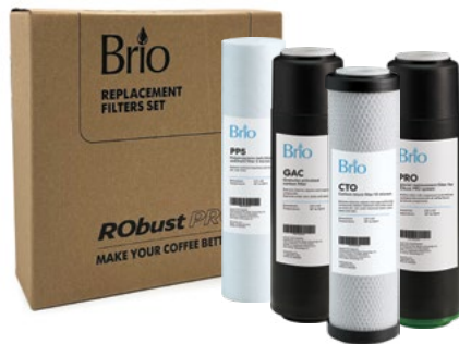
RObust PRO 500 4-Pack PP5 / GAC / CTO / PRO RF4PKROBUST