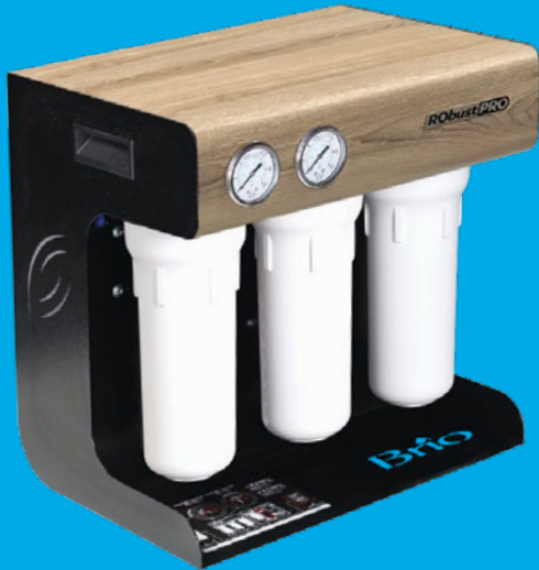
RObust PRO Reverse Osmosis System